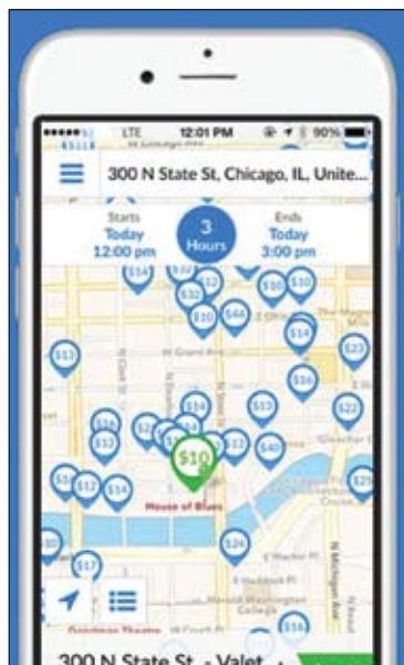
SpotHero map with prices

"Customers have told me personally that they can't believe we're able to post such low rates," he said. "After organizing a group parking special for a wedding – the wedding planner stated that