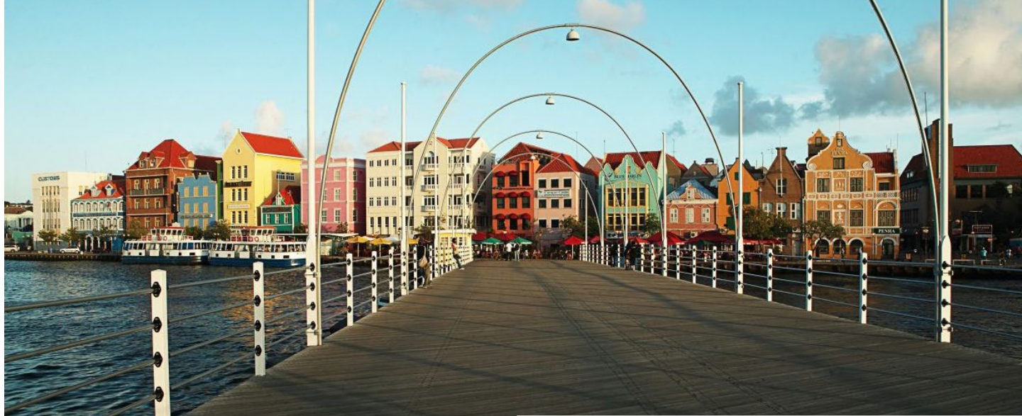
Queen Emma Swing Bridge in historic downtown Willemstad.