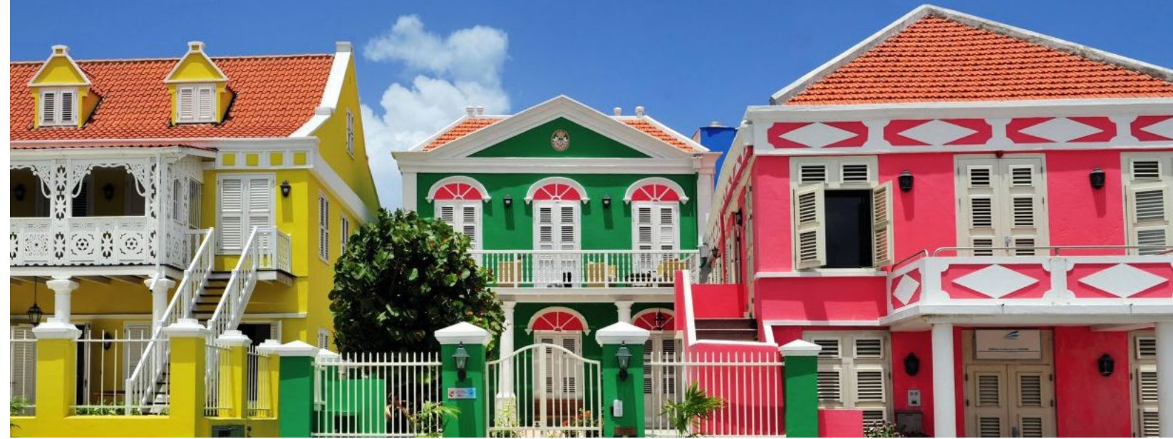
Colorful buildings in the Pietermaai neighborhood.

the-art fitness center, bustling casino and various shops. Start your day with their sumptuous buffet and relax from 5:00-6:00 p.m. with Happy Hour Wine.