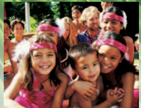
Experience a Maori Hangi Feast

national monuments and lush parks, actually modeled after Washington, DC. In its own right, Canberra is blessed with a wealth of cultural treasures including the Gallery of Australia, the Australian War Memorial and Parliament House.