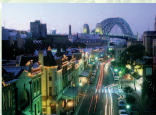
Shop in the Rocks District