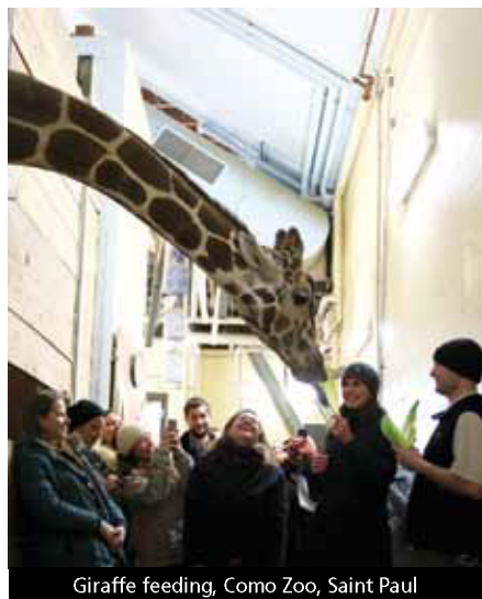
Giraffe feeding, Como Zoo, Saint Paul