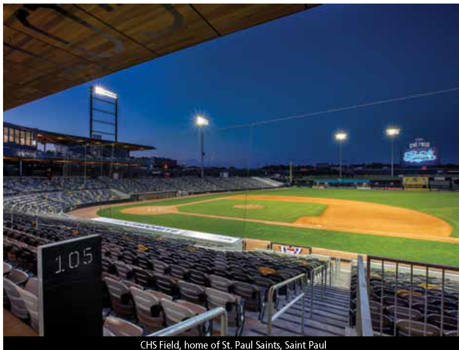
CHS Field, home of St. Paul Saints, Saint Paul

From the bustling downtown harbor, passengers can ride the river on the Padelford Riverboats. The 90-minute ride runs from May to October, while also showcasing bald eagles, herons and falcons.