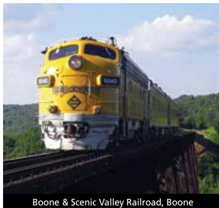
Boone & Scenic Valley Railroad, Boone