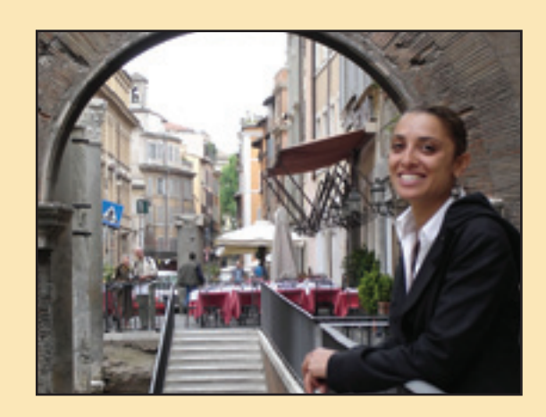
Visiting the Roman Jewish Ghetto with Jewish Roma Tours

The easiest and most convenient way to travel within Italy is via rail. My husband and I rode the trains between Florence, Rome and Venice, watching the splendid Italian countryside, as we sipped cappuccinos. And, arriving in the middle of these cities made it easy to start seeing the sights immediately. Rail Europe provides rail passes, tickets and reservations for train service throughout Europe. In addition, Rail Europe also sells point-to-point tickets on scenic trains, high-speed trains, and Rail 'n Drive passes, which combine train travel with car rental. Rail passes must be purchased before leaving the US, as they are not sold in Europe. For reservations, call 888.382.7245 or visit www.raileurope.com.